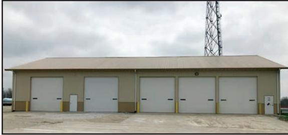
Pictured is the north side of the warehouse that sits on the east side of the headquarters building. We installed two new overhead doors and replaced two smaller overhead doors with larger ones to accommodate the larger trucks.

There are several benefits to doing so. One benefit regarding our budget is that now is a good time to secure a long-term, low interest rate loan to pay for the project. Another reason to move ahead is if we halted the work now, we would be on the hook for stranded costs associated with design and development of the construction drawings, budgets and staff time spent planning the project